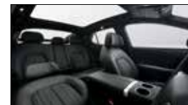
Massage Seat With Heated and Ventilated System