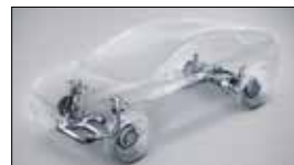
Air Suspension and Continuous Damping Control (CDC)