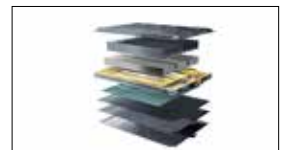
Golden Shield Battery Nepal's Most Advanced Battery